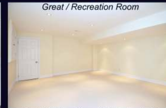
Great / Recreation Room