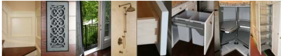
Just a few examples showing the exceptional attention to detail!

Lots more photos and link to Virtual Tour at: http://www.inthebeach.com